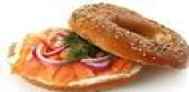
Smoked Salmon Bagel