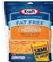
Low Fat Cheese