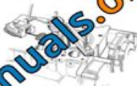
Fig. A-10—Checking cylinder bore extension

A small hole is drilled through the ring, then the hole is sealed with the Shimor M54 Compressor, to avoid oil leakage past the ring.