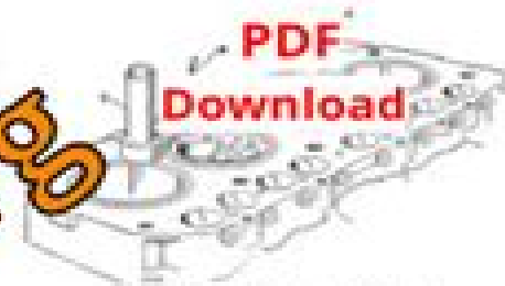
Fig. A-11—Checking piston clearance