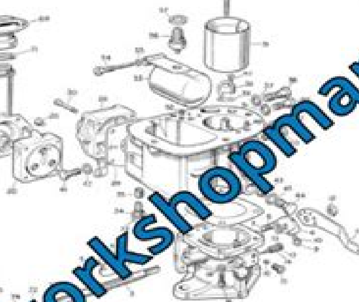
Fig. A-1—Layout of components, to this point