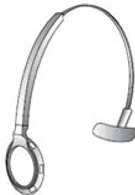
Replacement headband attachment