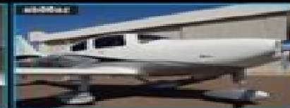
2013 Cessna 400 Corvallis TTx With Intrinsic Flight Deck & G2000 All Glass Cockpit! Speed, Comfort, Safety & Style! Secure Your SN Now. $733,950