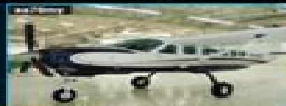
2009 Cessna Caravan 208 90 TT, G1000 Flight Deck, Very Well Equipped, Excellent Maintenance, US Based & Dry Climate, Hangared, Like New!