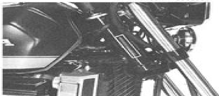
The frame serial number is stamped on the steering head right side.