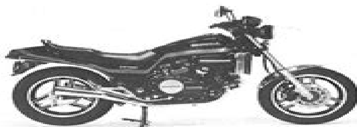
V45 SABRE BEGINNING F NO. RC070 • CM000001 E NO. RC07E-2000001