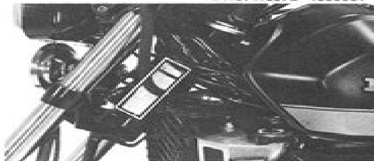
The vehicle identification number (VIN) is on the steering head left side.