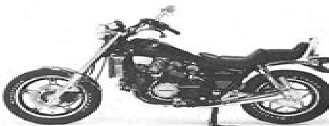
V45 MAGNA BEGINNING F NO. RC071 • CM000001 E NO. RC07E-4000001