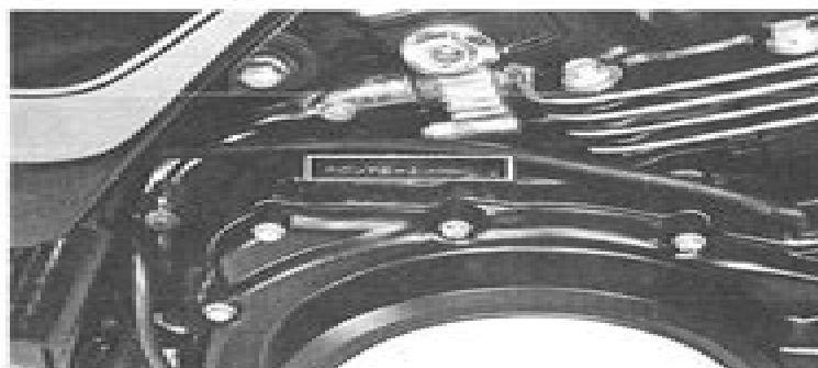
The engine serial number is stamped on top of the right crankcase.