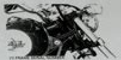
(1) The frame serial number is stamped on the left side of the steering head.