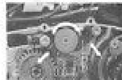
Fig. 1-20 Timing pulley and chain roller