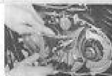
Fig. 1-17 Timing pulley