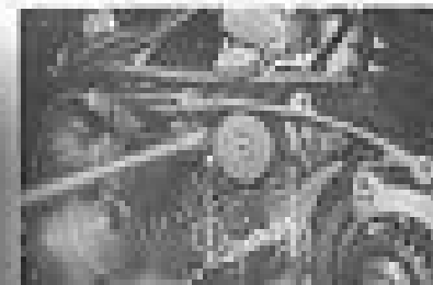
Fig. 1-18 Timing pulley and chain roller