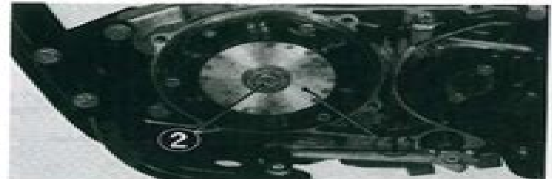
Fig. 3-80 (1) Generator rotor (2) Bolt