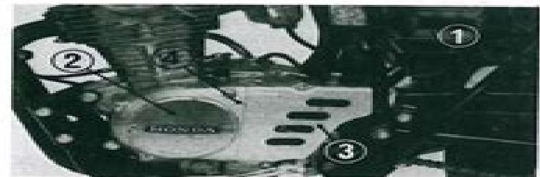
Fig. 3-79 (1) Wire harness connector (2) A.C. generator cover (3) Left crankcase rear cover (4) Left crankcase cover