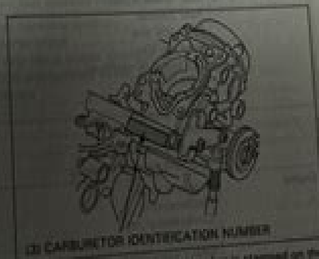
(3) CARBURETOR IDENTIFICATION NUMBER

(2) The engine serial number is stamped on the right side of the upper crankcase.