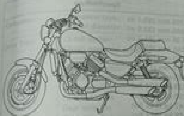
(1) FRAME SERIAL NUMBER

(1) The frame serial number is stamped on the right side of the steering head.