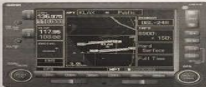
(GPS™ 500 Series)

GPS is a trademark of Garmin, Ltd. or its subsidiaries and may not be used without the express permission of Garmin.