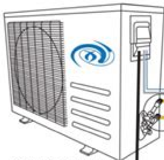
Outdoor Condensing Unit