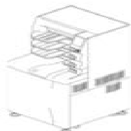
XG5000 or XG2000