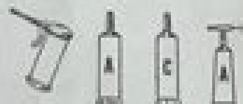
OMC TYPE "A" OMC TYPE "C" DRAIN GUN