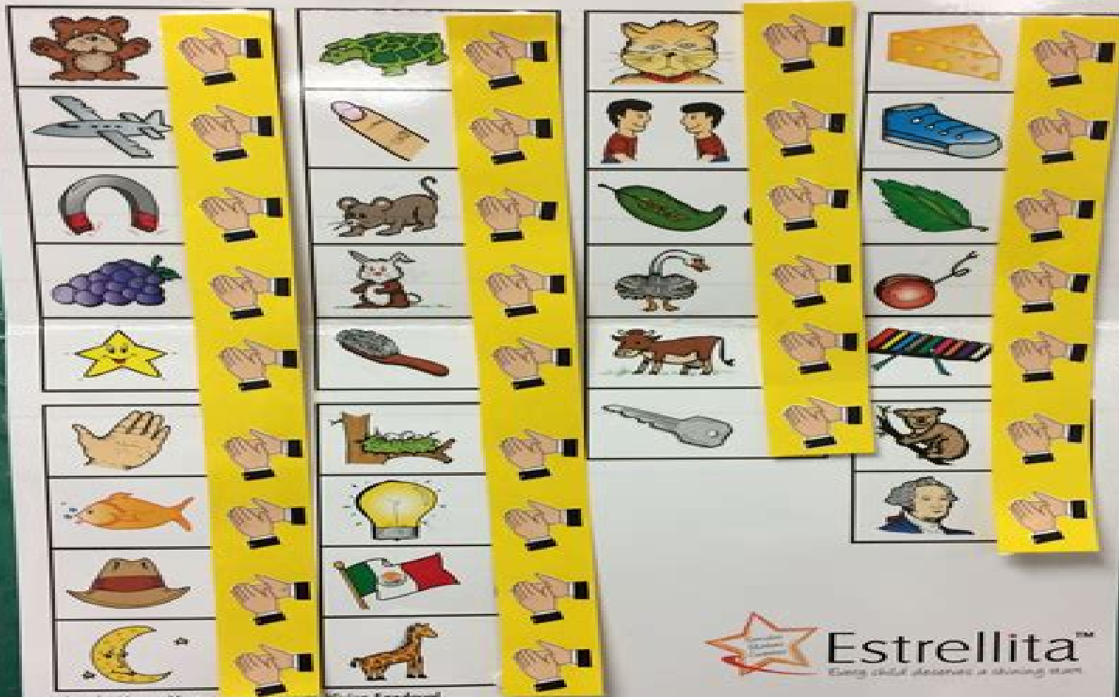
Chart by Karen Myer • Copyright © 1997, 2000 Illustrations by Wilen Sandoval