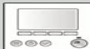
MAIN REMOTE CONTROLLER