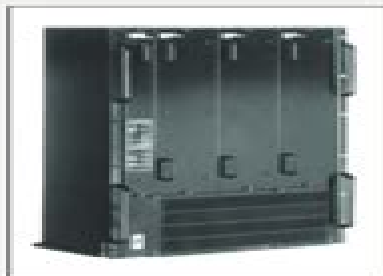
The rack-mounting amplifier, with Audio Processing Unit.