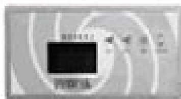
SPA SIDE (SOLD SEPARATELY) PART# 9735-011 MFG# 0202-007050