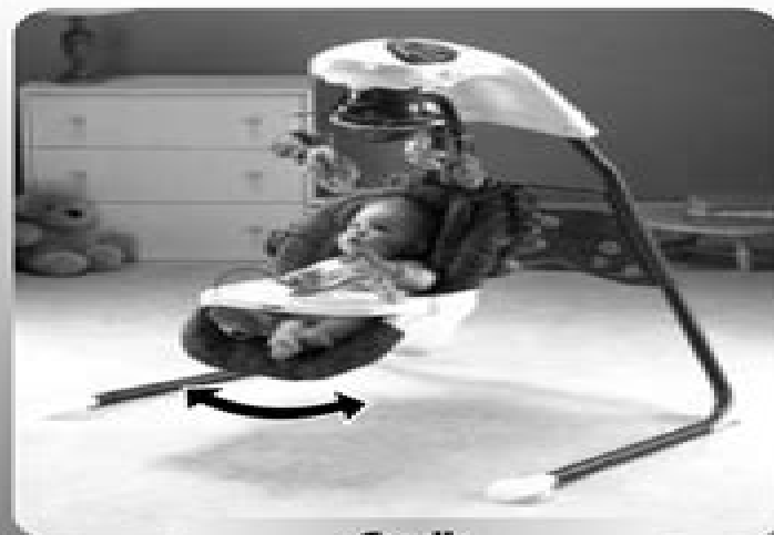
Cradle (Seat moves side to side)