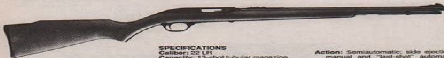
MODEL 75C $111.95

Stock: One-piece walnut-finished hardwood Monte Carlo stock with full pistol grip (shown here with Glenfield 200C, 4X scope)