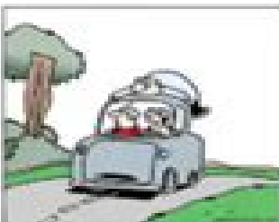
I just had to get out of the house without you for awhile. Look!