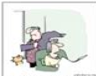
For the last time, the cat doesn't NEED to go for a walk!