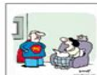
Still struggling with your post-retirement identity, Marv?