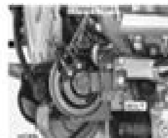
Fig. 10-10-102 Insert the special tool into the tensioner body.

Remove the cam chain tensioner after test and timing marker.