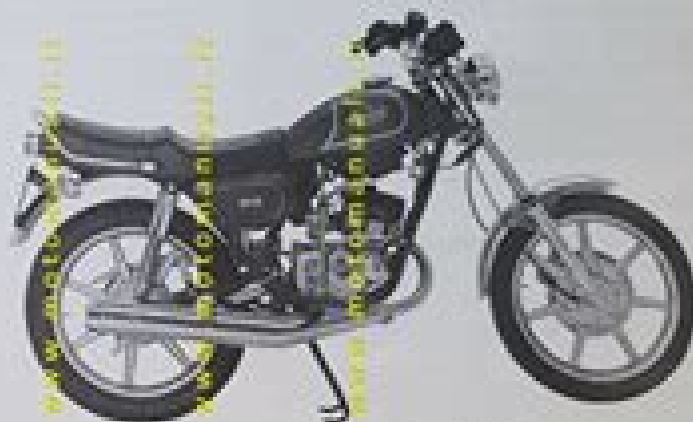
Fig. 2 - Motociclo -Qltera 125 TQ3-