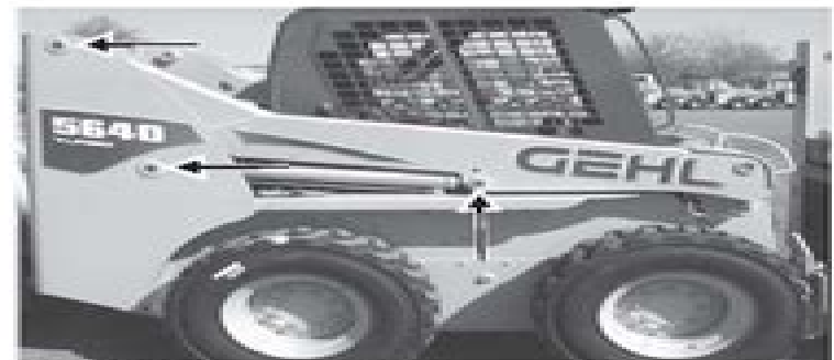
Fig. 3-10 Grease fitting locations.