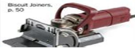
Biscuit Joiners, p. 50