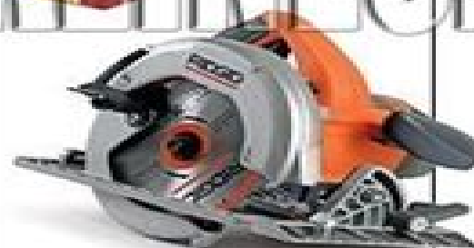
Circular saws, p. 30