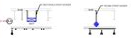
SECTION 05100 - DUCT HANGERS PART 1 - SUMMARY A. Section Includes 1. Solid Duct Hanger Details