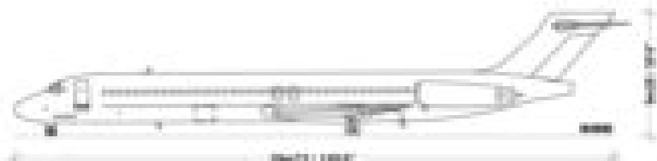
McDonnell Douglas MD87