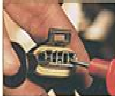
Fig. 2.2. Modelo de trabalho de alimentação dos sensores V33.