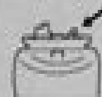
RIGHT SIDE FRAME VIEW