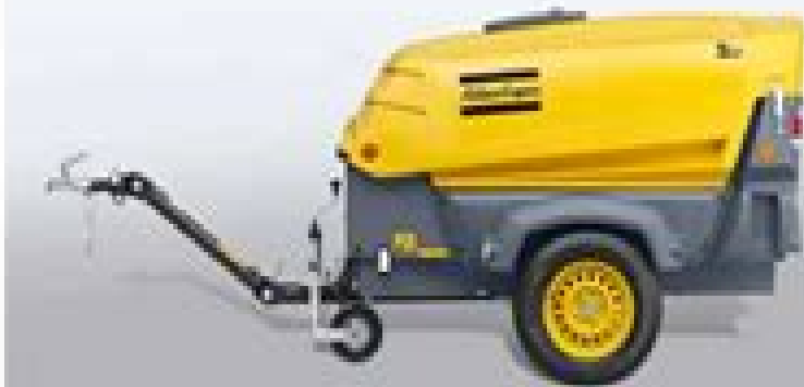
Un compresor transportable moderno para trabajos de construcción

frecuentemente informes de estado de la instalación de compresores en distintos niveles, desde una visión general hasta detalles de máquinas específicas.