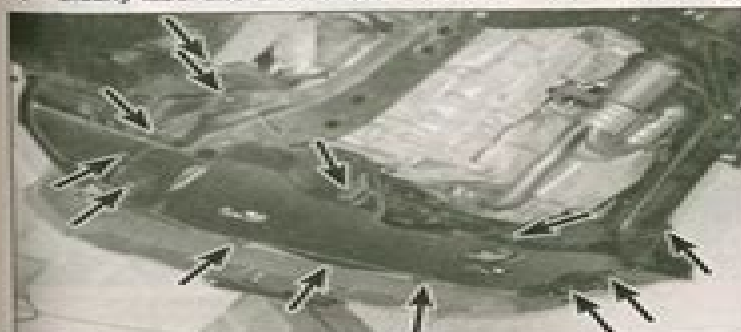
7.20 Location of the engine splash shield fasteners - some hidden from view