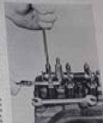
Turning the valve pin is used to adjust valve timing clearance.