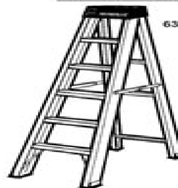
Series 6300, 6400 & 6900