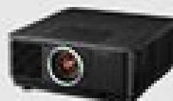
Image Quality, Functionality & Reliability – The new test set raised a level higher