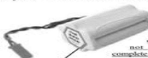
Bird Seed 8.4V 600mAh Battery [#CNE050]

Connect the battery pack to the charger for 1.5 hours or until very warm to the touch. Battery is NiMH and comes partially charged. Do not overcharge. Do not completely drain a NiMH battery!