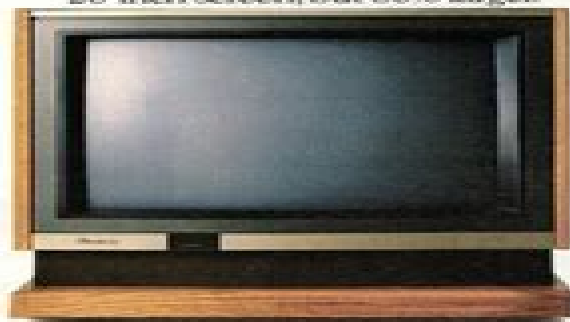
The world's first 35-inch, direct-view television, 86% larger than a 26-inch set, and can deliver a stunning 760 lines of resolution.

Which helps explain how in 1986, we were the only television manufacturer with the technology to create a 35-inch conventional tube television. With a picture as sharp and clear as a 26-inch screen, but 86% larger.