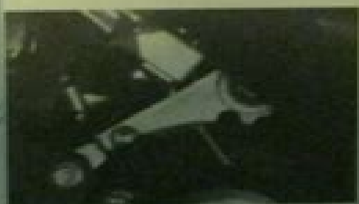
ENGINE SERIAL NUMBER LOCATION