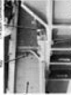
Ring and Support