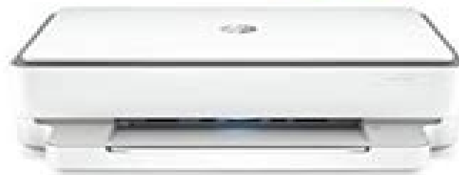
HP ENVY 6055