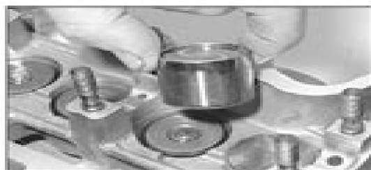
11.11a Refit each follower to the cylinder head ...

one into its original location in the cylinder head. Ensure each shim is correctly located in the top of the its relevant follower (see illustrations).