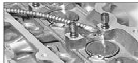
11.12 Lubricate the bearings with clean engine oil then lay the camshaft in position

20 Check the valve clearances as described in Section 10 then refit the camshaft cover as described in Section 4.