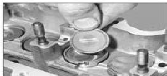
11.11b ... and refit the shim, ensuring it is correctly seated

16 Refit the bearing cap nuts, tightening them by hand only. Working in the specified sequence, tighten the nuts by one turn at a time to gradually impose the pressure of the valve springs on the bearing caps (see