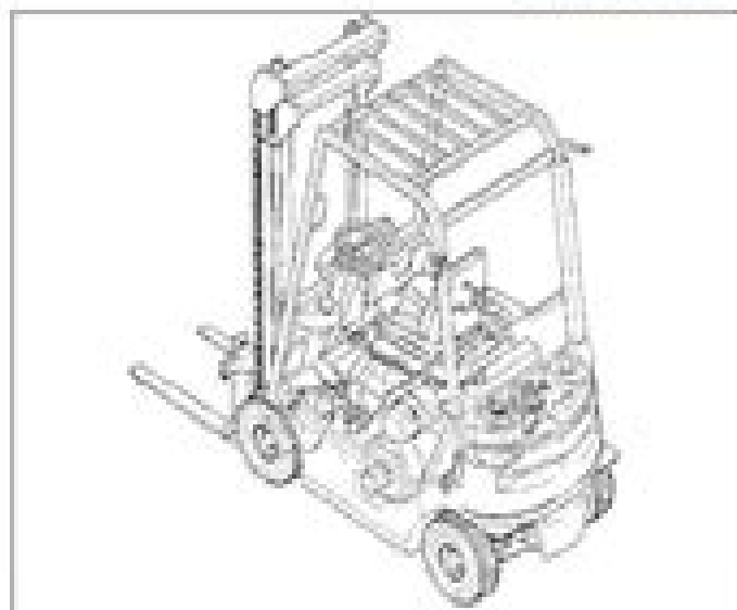
Small, standard type (1 front to back)