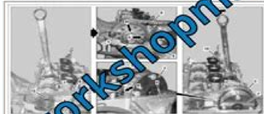
Fig 3: Adjusting Camshaft