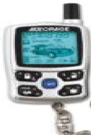
Model: XT-720LCD RS-720LCD, RS-520LCD