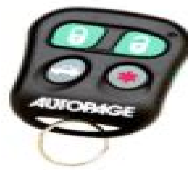
Model: XT-60 RS-650 Plus, RS610 Plus, RS-610, RS650