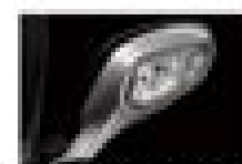
LED TURNING SIGNAL LIGHT