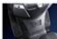
WARM AIR OUTLET