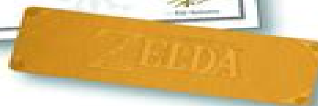
2.5x7.5 Gold 2-Sided Bookmark

BOX SET INCLUDES: • The Legend of Zelda: Phantom Hourglass • The Legend of Zelda: Twilight Princess • The Legend of Zelda: Spirit Tracks • The Legend of Zelda: The Wind Waker • The Legend of Zelda: Skyward Sword • The Legend of Zelda: Breath of the Wild