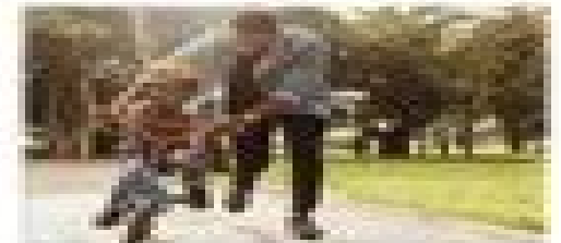
riding a bicycle