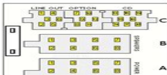
36 (20+8+8) pin Head Unit / Car Stereo ISO connector