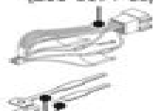
Lever (D10-7012-04) x2