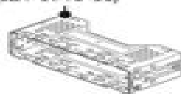
* Screw (4x16) (N84-0016-48)