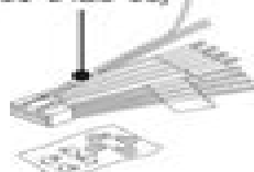
* Screw set (N99-1757-15)