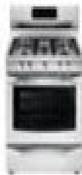
Kenmore 74343 5.6 cu. ft. Gas Range w/ Convection Oven - Stainless Steel