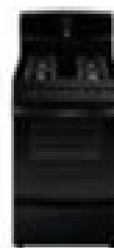
Kenmore 74419 4.2 cu. ft. Gas Range with Broil & Serve Drawer - Black