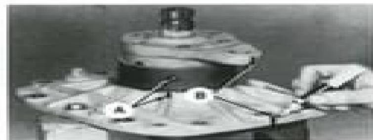
Fig. 18—Before disassembling differential carrier, make alignment marks (A and B) as shown for reassembly. If bushings are of new design, oil seal carrier (2) alignment is not required.

To remove shaft axle (42—Fig. 17) and pinion housing (22), remove felt seal (36) and oil seal (23). Loosen nuts securing shaft axle to housing. Disconnect tie rod ends (49 and 47). Disconnect steering cylinder from right-hand steering arm. Remove bearing pin covers (27 and 28) and shims (29 and 30). Use special puller (CA-14632) to remove bearing pins (32 and 33). Remove shaft axle and housing assembly.